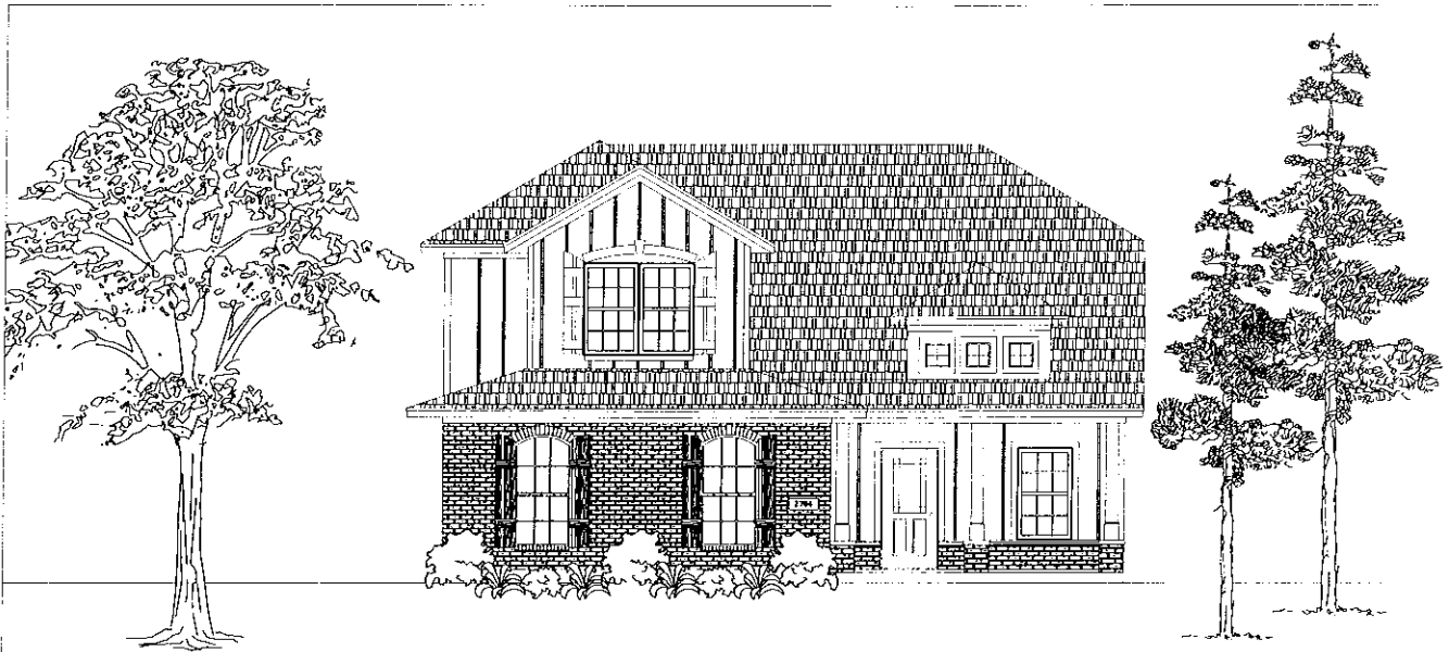
2704 Horse Haven Ln. Horse Haven Estates